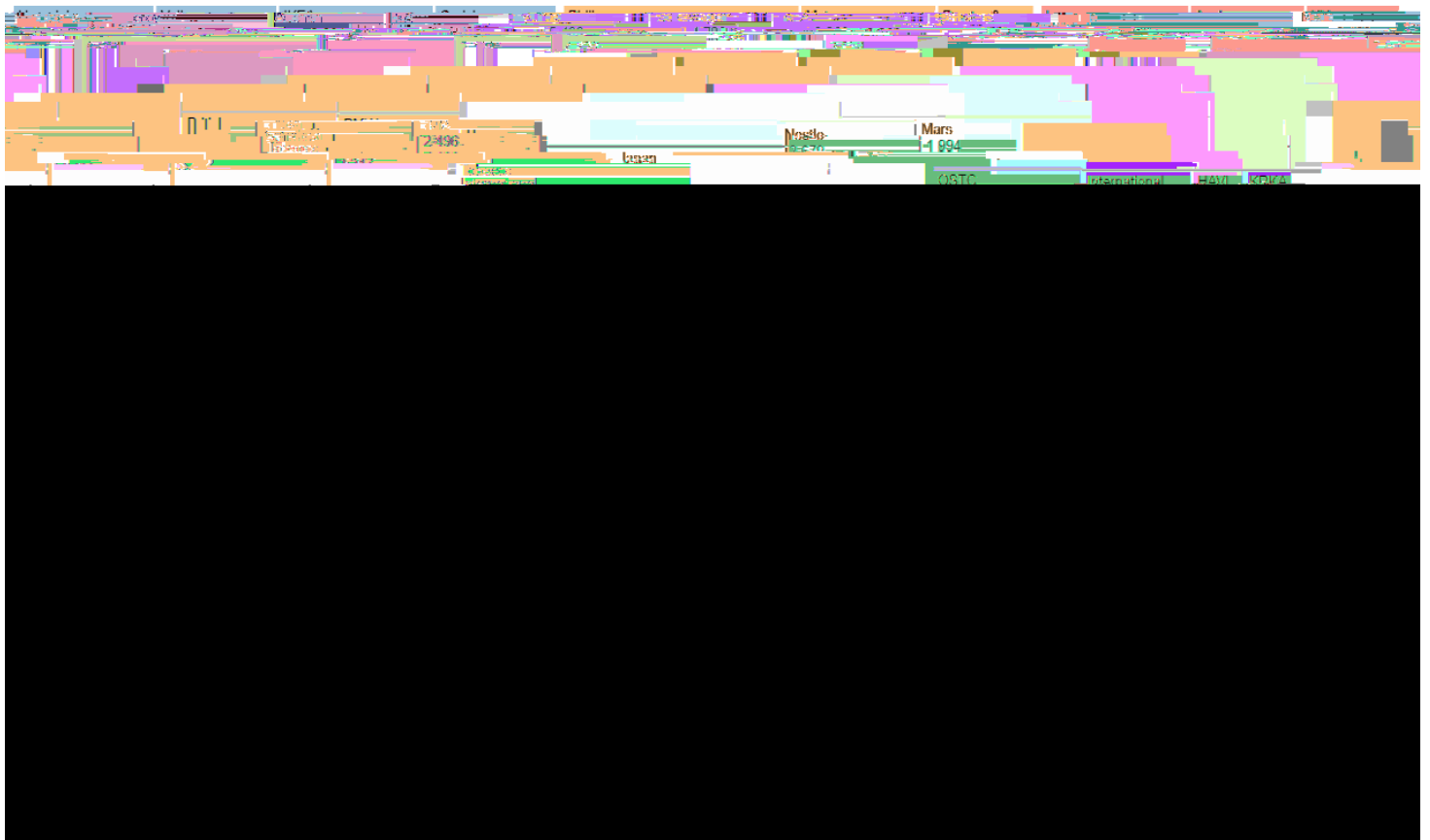
TOP-800 companies by local revenues in the Russian Federation (in million US dollars) and KSE status, data collected by KSE Institute